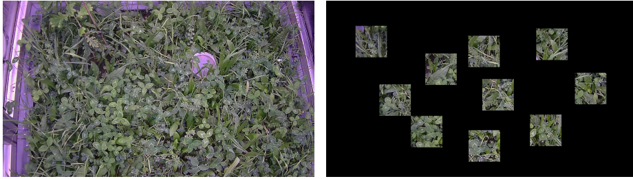
Fig. 2: An example of a random patch selection with Monte-Carlo Cropping.

During training, we sample equally sized square patches from the original image, an example of which can be seen in Figure 2. It is visible that the number of pixels shown to the network is significantly reduced, depending on the size of the patches and number of patches sampled. Hence, computational complexity can also be reduced with MCC. It should be noted that patches are selected entirely at random, i.e., all pixels can be contained in multiple patches sampled.